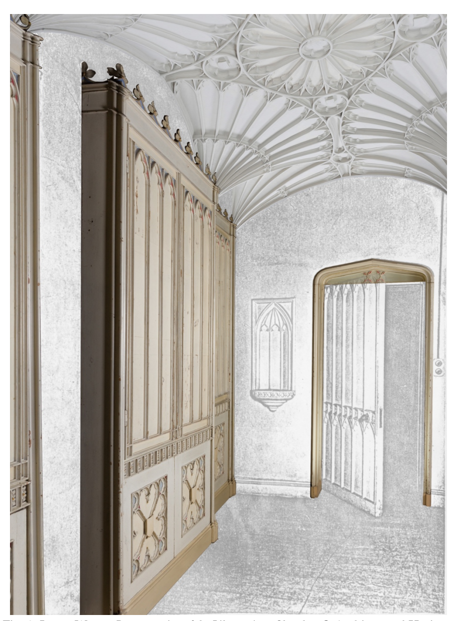
Fig. 6: James Wyatt, Reconstruction of the Library Ante-Chamber.

The fragments from Lee's Library Ante-Chamber, consequently, are important remains from a house central to the late eighteenth-century Gothic Revival. They connect two of the most famous Gothic Revival houses: Strawberry Hill (via Walpole) and Fonthill Abbey (via Wyatt) and record Wyatt's work on a modest, though architecturally informed and ambitious, project. Lee's Library Ante-Chamber is a snapshot of Wyatt's pre-Fonthill and Ashridge Park Gothic, and it significantly overhauls our understanding of his imaginative and scholarly engagement with medieval forms. It reveals that, unlike the Strawberry Room, Wyatt pursued an ambitious and densely decorative programme in what is essentially a small thoroughfare opening into Barrett's Gothic Library.