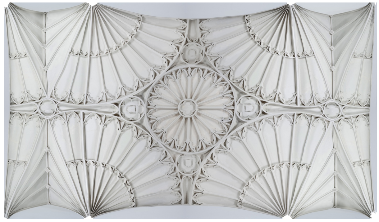
Fig. 4: James Wyatt, Library Ante-Chamber Vaulting.