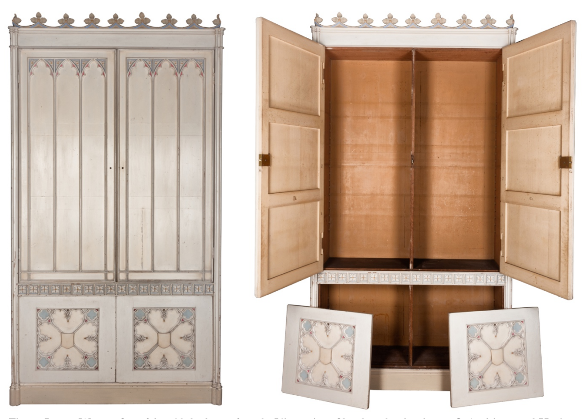
Fig. 5: James Wyatt, One of the wide bookcases from the Library Ante-Chamber: closed and open.

Earl of Egmont, to Catherine Compton in January 1756. Walpole also acquired blue and white barber-pole painted Welch chairs from Dickie Bateman's house, the Priory, Old Windsor, Berkshire, in 1774, which he displayed in Strawberry Hill's Star Chamber.<sup>23</sup>